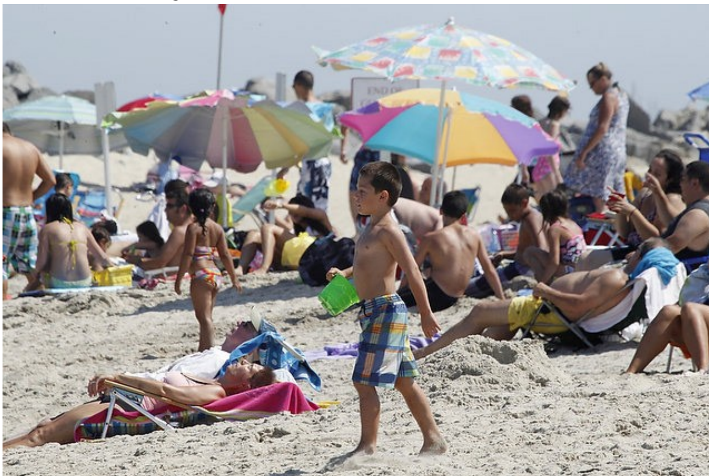
Sandy Hook Beach, July 2012

What will you do with your trash when you are at the beach?